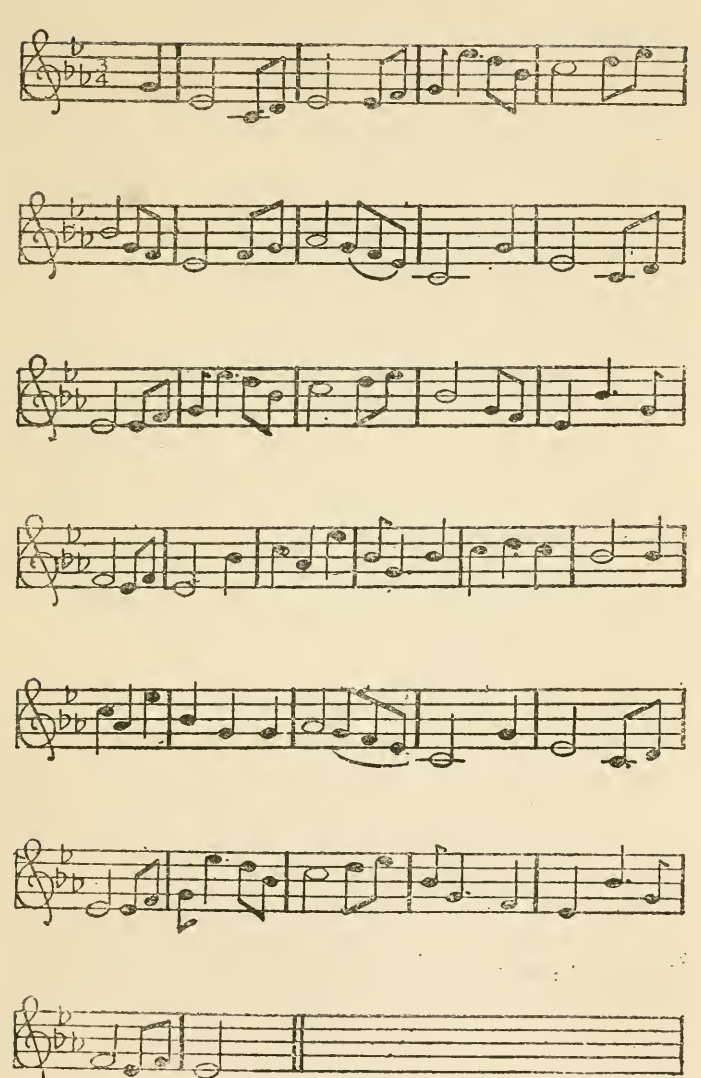
THE WILD GOOSE.